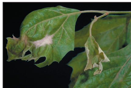
Figure 1a. Powdery mildew ( Microspora alni ) caused white patches and distorted these sycamore leaves.

The best method of control is prevention. Avoiding the most susceptible cultivars, placing plants in full sun, and following good cultural practices will adequately control powdery mildew in many situations. Some ornamentals do require protection with fungicide sprays if mildew conditions are more favorable, especially susceptible varieties of rose and crape myrtle. (See Table 1.) For a list of other common ornamentals susceptible to powdery mildew, see Table 2.