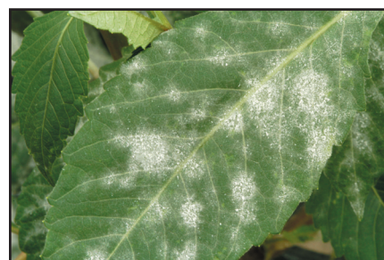
Figure 1c. The upper surface of this dahlia leaf is supporting extensive white growth from powdery mildew infections.