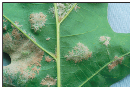
Figure 1b. Powdery mildew growth covers the underside of this oak leaf.